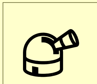
A RECENT PHOTO OF THE CUAS OBSERVATORY.

CUAS has been sent a new tool kit from the Night Sky Network , this one dealing with glass and mirrors. In fact, the kit includes what amounts to an optical bench! We'll have it out at the May meeting. It's a good way to show how telescopes work to the lay public.