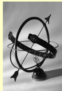
Depiction of an Armillary Sundial.